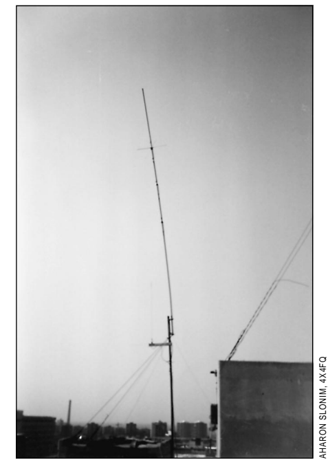
The antenna for the 4X6TU/B beacon, mounted on the physics and astronomy building of Tel Aviv University.

NCDXF with several grants, provided funds for prototype Phase III beacon construction.